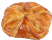
F74581 Shell Flower 40g x 200 RTB