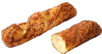
F73568 Danish Twist Cheese 130g x 50 RTB