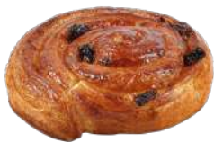
F74641 Danish Raisin Roll 30g x 200 RTB F73976 Danish Raisin Roll 40g x 200 RTB F73562 Danish Raisin 70g x 50 RTB