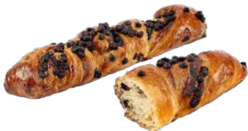
F73563 Danish Twist Chocolate 130g x 50 RTB