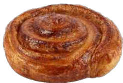
F73569 Danish Cinnamon 70g x 50 RTB