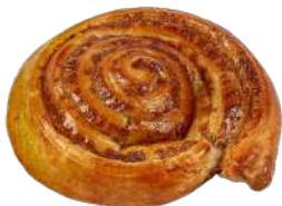
F73865 Danish Cinnamon 30g x 200 RTB