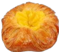
F74006 Danish Custard 30g x 200 RTB