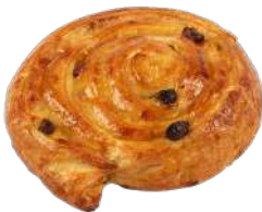
F73866 Danish Raisin 30g x 200 RTB