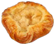
F73867 Danish Apple 30g x 200 RTB