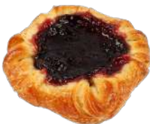
F74004 Danish Blueberry 30g x 200 RTB